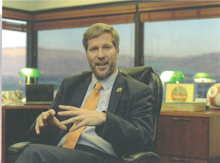
(1) View towards Albuquerque along the old Route 66, with some of its surviving neon motel signs (2) Mayor Tim Keller (3) The Rembes (from l-r): Penny, Matt, Jay and Armin